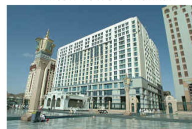
Movenpick Anwar Al Madinah

Its proximity to the airport makes it the perfect choice for business travellers.