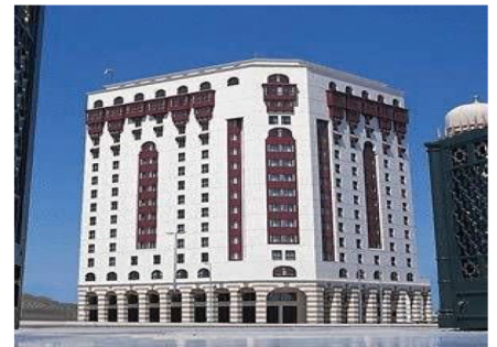
Elaf Taibah – 4 Star

T: +966-(04)-8180050 Fax: +966-(04)-8180030