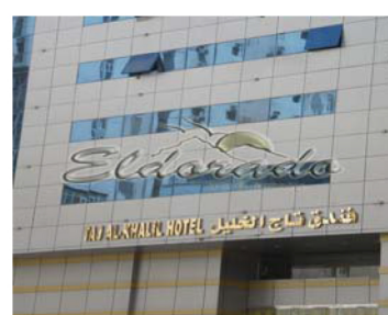
Taj Al Khaleel